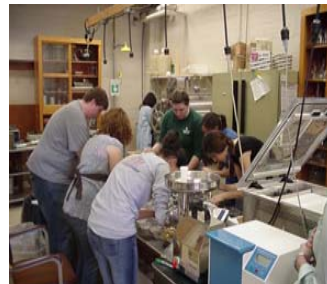
Figure 2. Dilution and plating of samples.

Statistical Analysis: The “double-dipping” experiment was replicated 8 times and all plating was in duplicate. The dipping treatments were subjected to an analysis of variance (ANOVA) using SAS (2006) to determine if there was a significant ( P \leq 0.05 ) overall effect due to these treatments. Since there was a significant effect, the means were separated using the pdiff command of SAS.