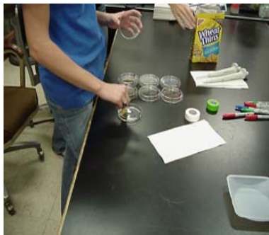
Figure 1. Dipping wheat thins in sterile water.

MATERIALS & METHODS: Prior to conducting the dipping experiment, total bacteria in the mouth was measured by rinsing each student’s mouth with 20 ml of sterile water which was then serially diluted and plated in duplicate on nutrient agar. After incubation for 48 hours at 38 C, plates from dilutions with between 25-250 colony forming units (cfu) were counted and converted to log cfu per ml of the rinse solution. Wheat thins were used as the food product and 20 ml of sterile water acted as the dipping solution. Each student in the CI team conducted four treatments. For the dipping treatments, a cracker was bitten, dipped in the sterile water then discarded (Figure 1). The control treatments consisted of dipping a cracker without biting. The four treatments were: 3 dips without biting, 6 dips without biting, 3 dips with biting, and 6 dips with biting. Each of the 8 students then took a 1 ml sample from each dipping solution which was serially diluted then plated in duplicate (Figure 2). Again, after incubation for 48 hours at 38 C, plates from dilutions with between 25-250 colony forming units (cfu) were counted and converted to log cfu per ml of the dipping solution.